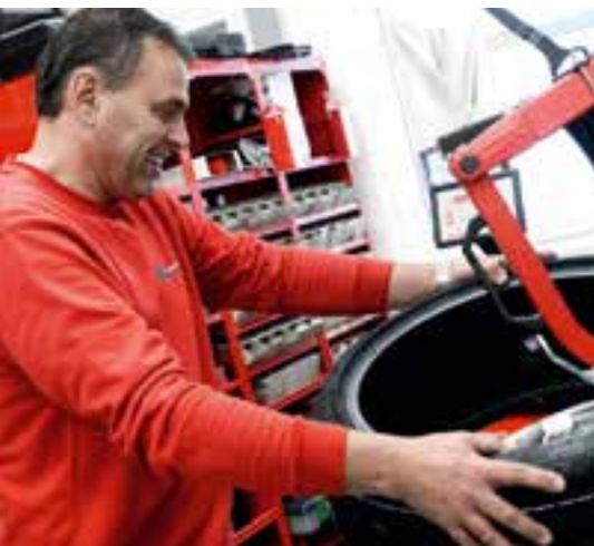
Fitting and balancing tyres, one of the tasks in the workshop and on the track.