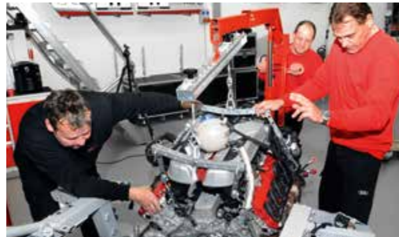
The 560-hp engine in the Audi R8 LMS ultra is carefully restored to its former glory.

However different these tasks may well be, the spirit associated with racing and the training programmes is always the same at TKL Motorsport: a self-contained team performance is only possible with a good team, and ultimately this involves sporty pleasure and joint successes under the symbol of the four rings.