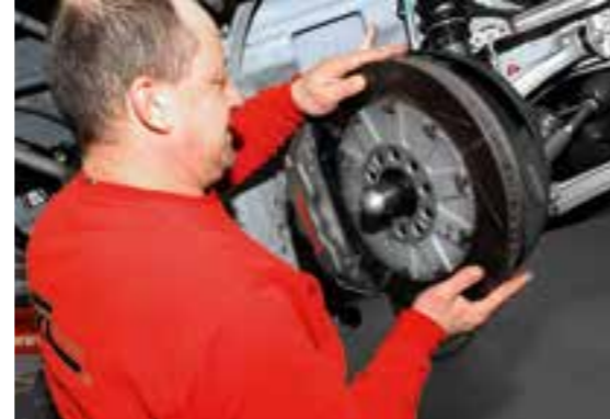
The brake system is checked thoroughly of course.