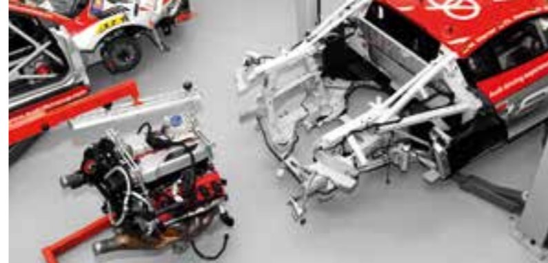
No part remains untouched. After the race the Audi R8 LMS ultra are totally overhauled.

Apart from competing on the track, racing involves one thing above all else: a great deal of work that goes into preparations and debriefing. For Audi race experience racing cars are as perfect as any new car in a dealership. “Before every race the cars are stripped down, checked, wear parts replaced, everything serviced, damaged components replaced and the racing cars rebuilt,” is how Marc Klöppel describes the work ethic. Two employees spend around a week on it – the equivalent of around 80 working hours. The 560-hp GT3 racing cars always roll out of the racing transporters in pristine condition into the pits on the track before they negotiate the 25-kilometre-long uphill and downhill stretch in the Eifel on the four racing tyres. “18 employees look after our customers and guests and the two racing cars on site,” explains Klöppel. At the famous 24 Hours in June, two additional members of staff reinforce the team that is on hand round the clock and is always kept up to date via radio. Refuelling, changing tyres and drivers are just the standard tasks for the busy employees. Whenever a rival leaves the R8 driver with absolutely nowhere to go – which happened several times in summer 2014 – you need to react instantly. The skilled hands replace a damaged rear-wheel suspension in an incredible 20 to 30 minutes. The same job would take several hours in a workshop.