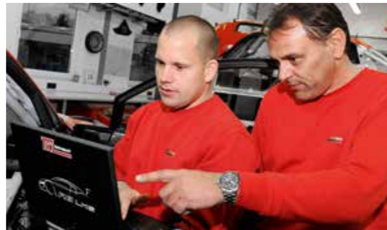
Motorsport without data analysis is virtually inconceivable nowadays.