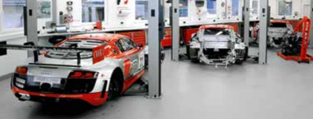
Perfect conditions in the workshops at TKL Motorsport – the Audi R8 LMS ultra are prepared for the races virtually under clinical conditions.