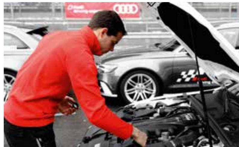
Final check before the course participants make their way onto the track in the training vehicles.