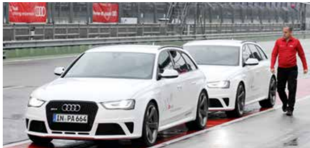
Well prepared track vehicles await participants at the Audi sportscar experience events.